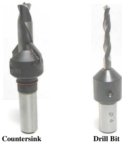
Figure: Qualified Tooling for CNC Machines

The qualified tool with holder shown in Figure