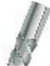
Figure : Solid Tool

Solid tools are usually made of High speed steel or High carbon steel. These tools are used on high speeds with sufficient quantity of cutting fluid to get good surface finish and longer tool life.